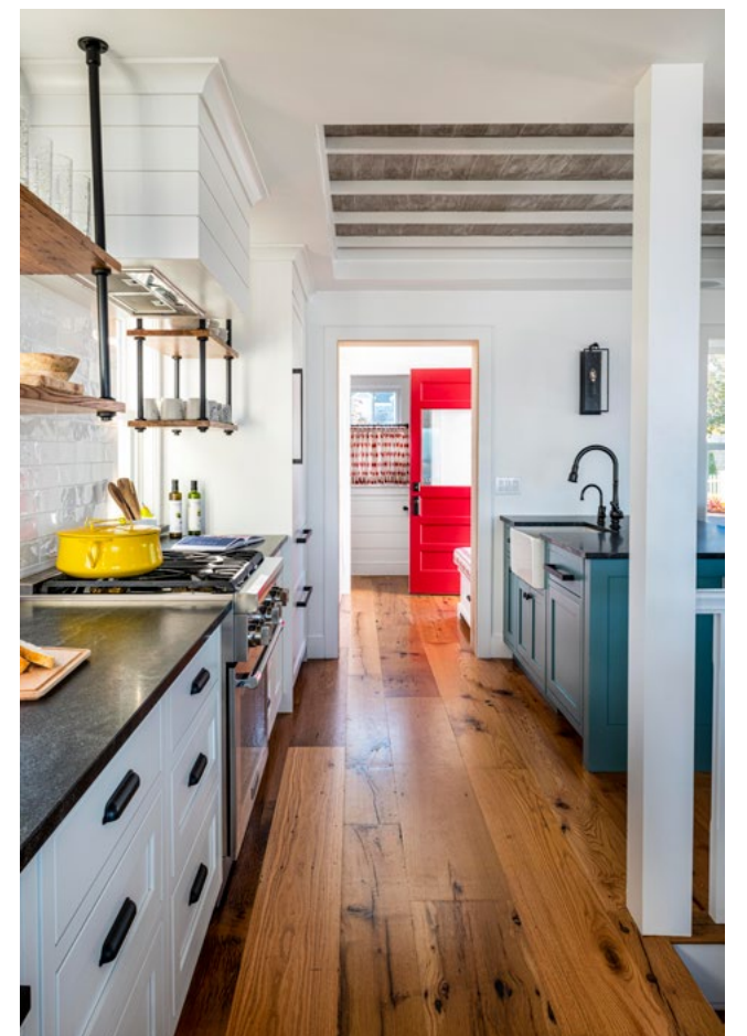
This handsome dining table, crafted from a single slab of walnut, was made by Wellfleet furniture maker Jeff Soderbergh. Right: Black mist granite countertops contrast with white Shaker-style cabinetry in the kitchen, which opens to the family room, below.