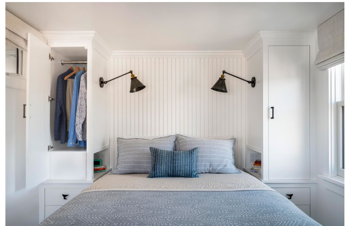
Built-in storage, featuring whimsical whale tale drawer pulls, creates a cozy and efficient space in the guest bedroom. Below left: Custom-made bunk beds are perfect for younger members of the family. The custom bathroom vanity was made of reclaimed chestnut.

"We developed a 'Cape Cod' palette—lots of blue and white with some pops of color—and we also pulled in