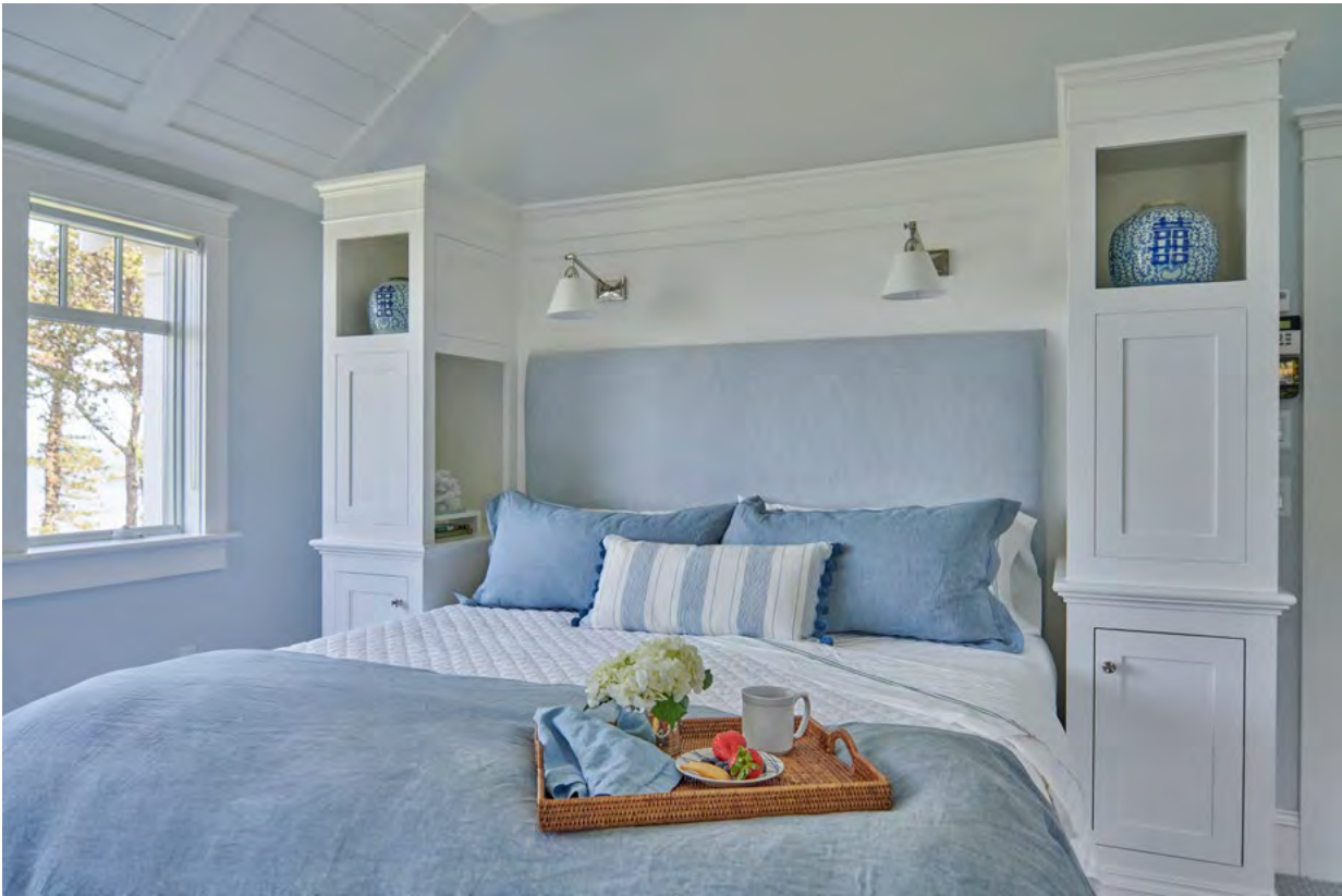
Above: The dining area has a commanding view of the water. Left: Blue and white make for a soothing color palette in the main bedroom, which features built-in cabinets that replace conventional bedside nightstands and a custom tufted headboard.