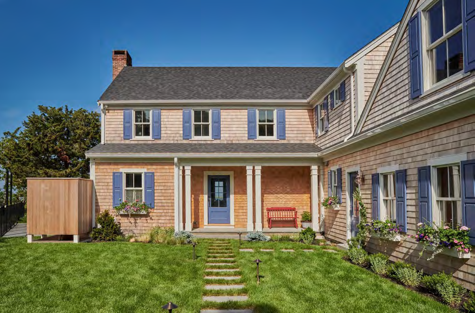
Above: The remodeled home evokes “old Cape Cod” outside with cedar shakes, window boxes, shutters, and monolithic granite steps. Below: One of the objectives was to add more windows to take in the spectacular water views.

The Orleans home had a great location surrounded by conservation land with woodlands and amazing estuaries. The problem was the house, built in 1996, didn't take advantage of its setting. The windows weren't large enough. The open floor plan was what the new owners were looking for, but it was in need of rearranging and updating.