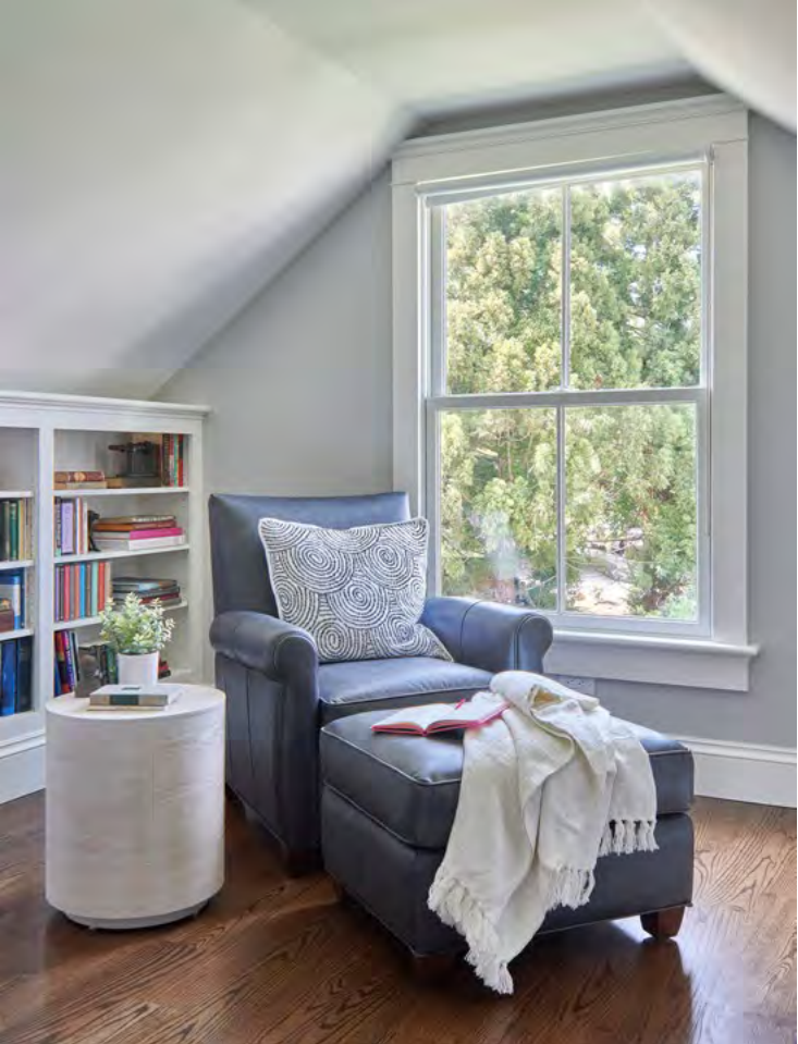
Right: A chaise lounge is the perfect place to read a book. Below: The blue and white coastal palette is reflected in the open plan kitchen-dining area.

The home’s floor plan was opened up and walls changed, while respecting the owners’ desire for a classic house. Crown molding detail adds a classic feature and enhanced character throughout the home. A half-bath was added off the entry as was a mudroom with built-in cabinets for organizing coats and hats and a bench for taking off those sandy shoes and muddy boots. Windows with cushioned benches in the living room invite reading and nature-gazing.