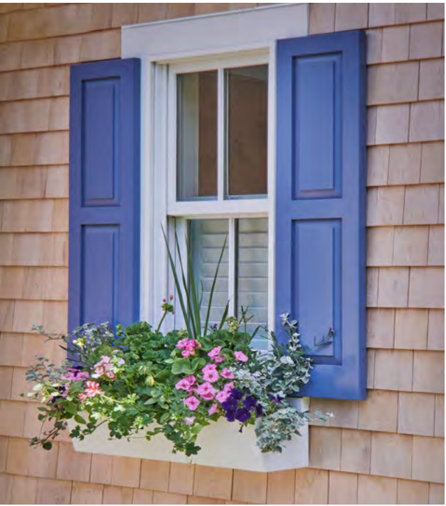
Above: A window box lends Cape Cod charm to the exterior. Right: A fanciful contemporary wallpaper perks up the downstairs powder room that features a custom vanity built by Spencer & Company. Below: The mudroom includes built-in cabinets and a bench.