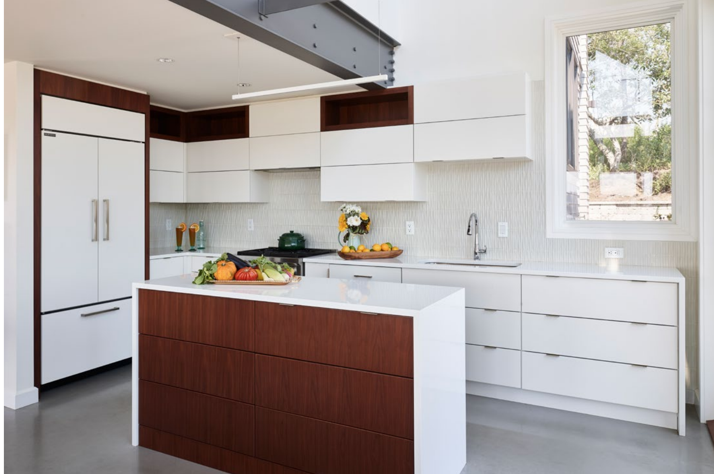
The modern kitchen design features minimalist cabinetry and a low-maintenance, polished Cambria quartz island with a waterfall edge. At right, the basement features a custom, climate-controlled wine cellar.

heat source. In a room filled with windows, space needed to be made for an entertainment unit. To house the only television in the home, a custom built-in shelf display made of walnut was designed to seamlessly integrate into the surrounding room elements, including the adjacent decorative half wall and bench seating in the dining area.