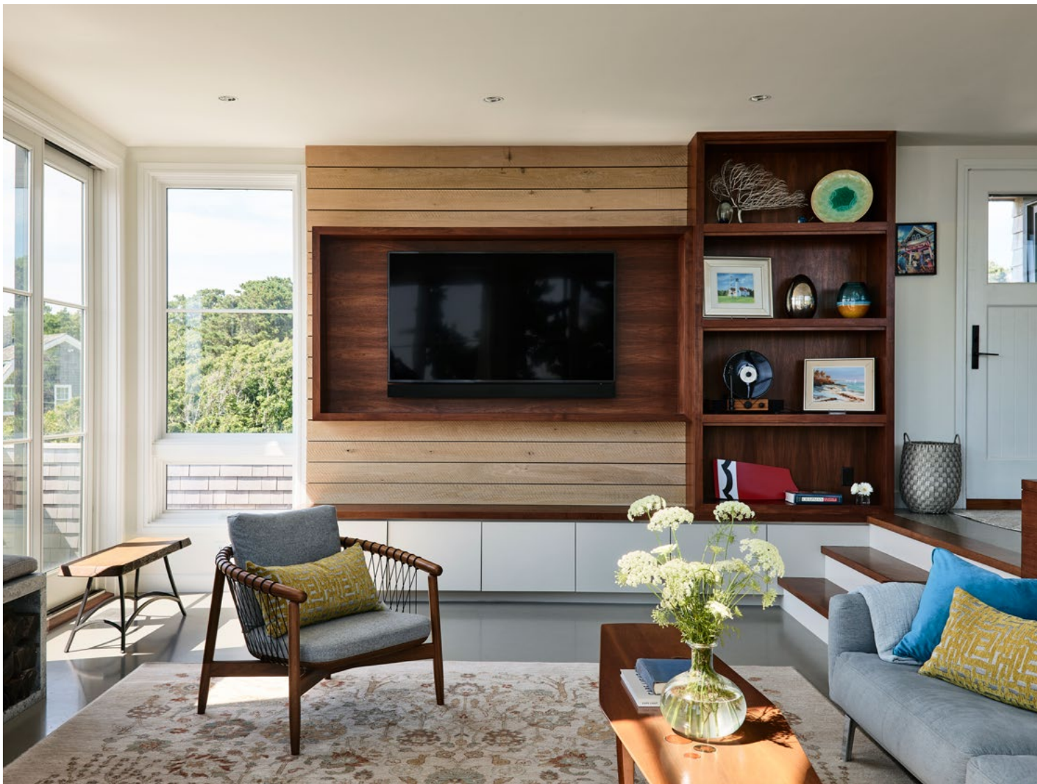
A custom built-in shelf display, crafted from walnut by Spencer & Company, was designed to seamlessly integrate into the open-concept, main-floor living area.