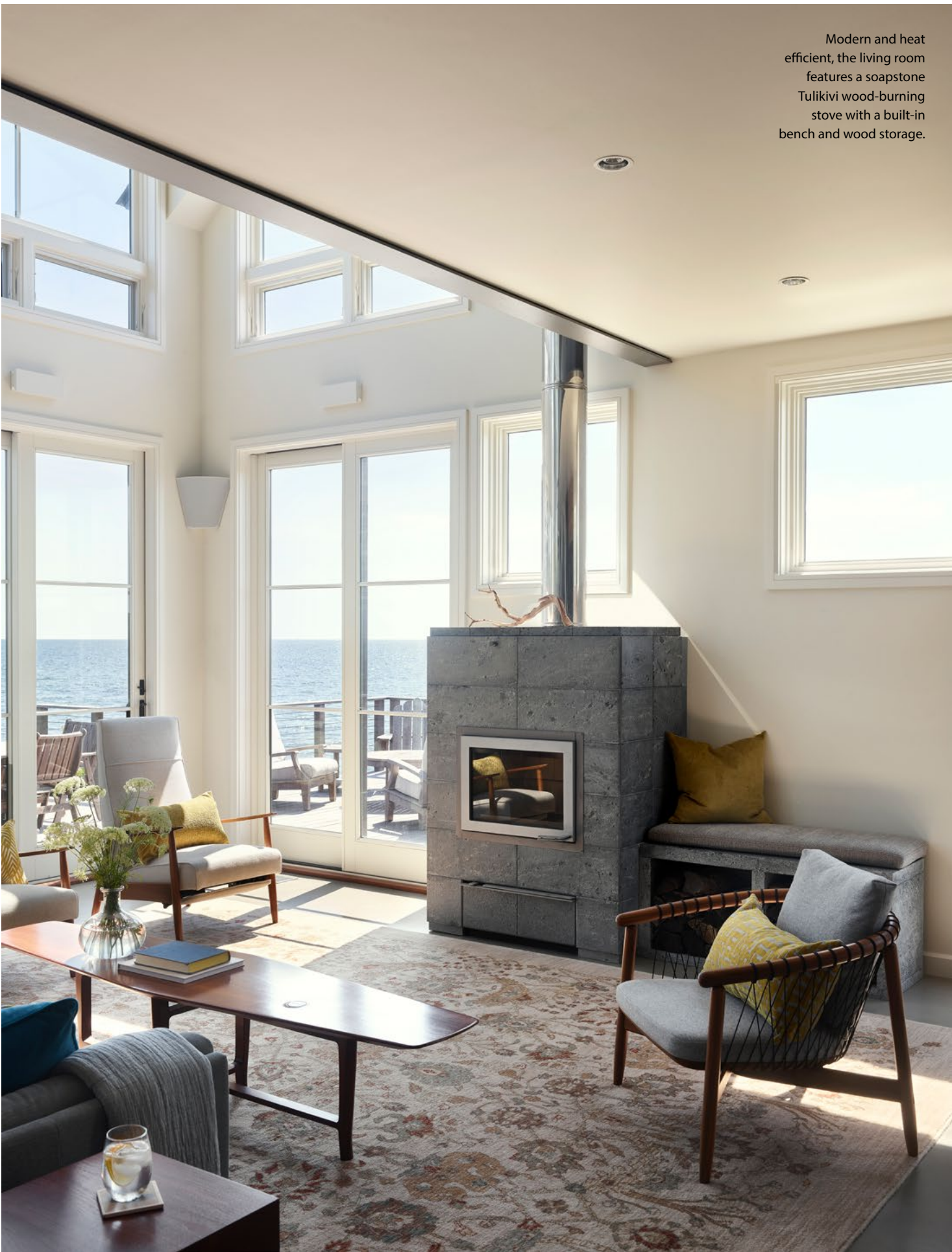
Modern and heat efficient, the living room features a soapstone Tulikivi wood-burning stove with a built-in bench and wood storage.

A couple looking to purchase property in Chatham but having little luck finding a home that would suit their needs, had a turn in fortune when they typed “Chatham architect” into Google.