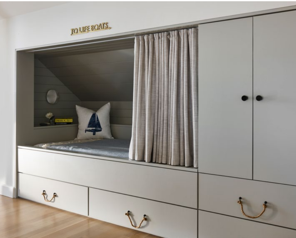
To take advantage of unused space and increase sleeping quarters for guests, a ship’s bunk with blanket storage was built into the eaves on the highest floor.

SV Design and the homeowners envisioned a modern design that would maximize every inch of space. The home’s open floor plan features a sunken living room and adjacent kitchen with two loft levels above that overlook the living spaces. After the heavy brick fireplace between the living room and slightly elevated kitchen was removed, Schneeberger was tasked with finding the best solution for improving the flow between the two living spaces, while maximizing seating capacity for dining. “The whole thing was kind of a game of Tetris in a way,” she says, asking rhetorically, “How do we get all these parts to work?” The solution was to design a built-in bench for the dining table that doubles as a decorative half-wall where the reverse side is used to anchor the living room sofa and built-in bar. The living room also features a Tulikivi wood-burning stove—with a built-in bench and wood storage—made of soapstone that is a modern Finnish design and an efficient