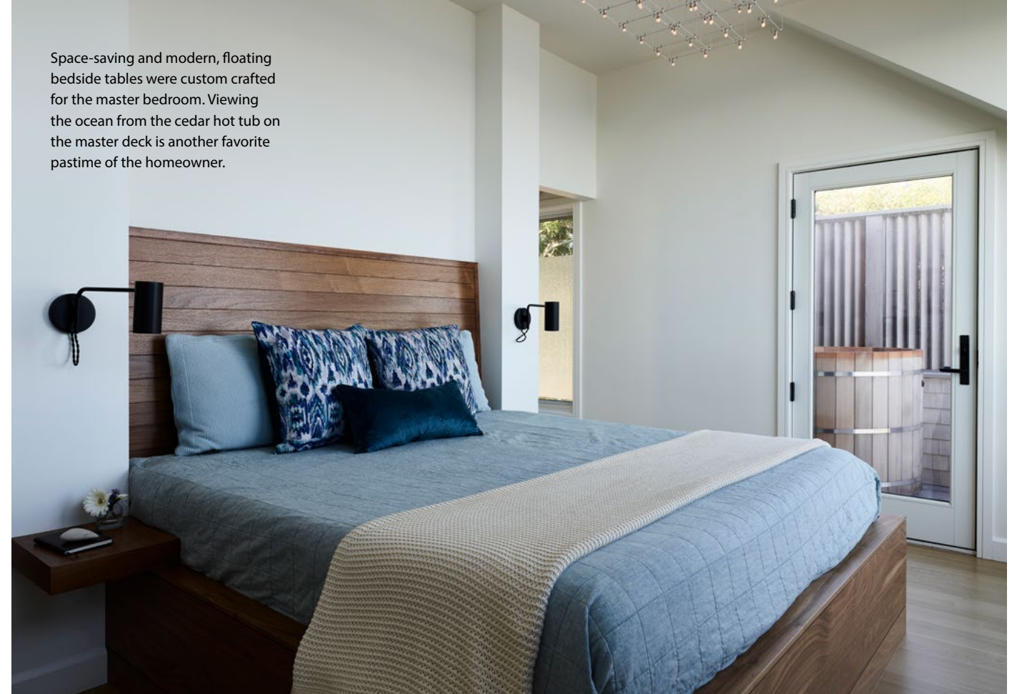
Space-saving and modern, floating bedside tables were custom crafted for the master bedroom. Viewing the ocean from the cedar hot tub on the master deck is another favorite pastime of the homeowner.

concern. Working with Classic Kitchens & Interiors, the team opted for customized white cabinetry with concealed grips for a streamlined, modern look.