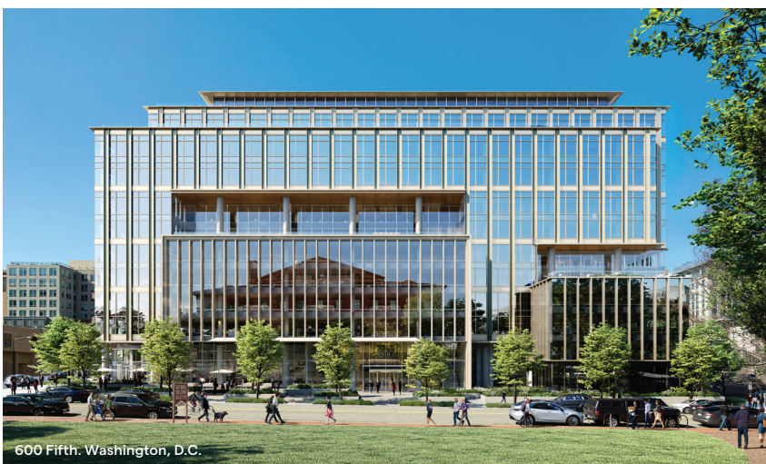
600 Fifth, Washington, D.C.