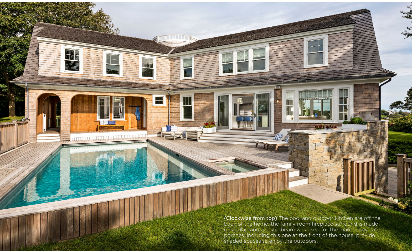
(Clockwise from top) The pool and outdoor kitchen are off the back of the home; the family room fireplace surround is made of shiplap and a rustic beam was used for the mantle; several porches, including this one at the front of the house, provide shaded spaces to enjoy the outdoors.