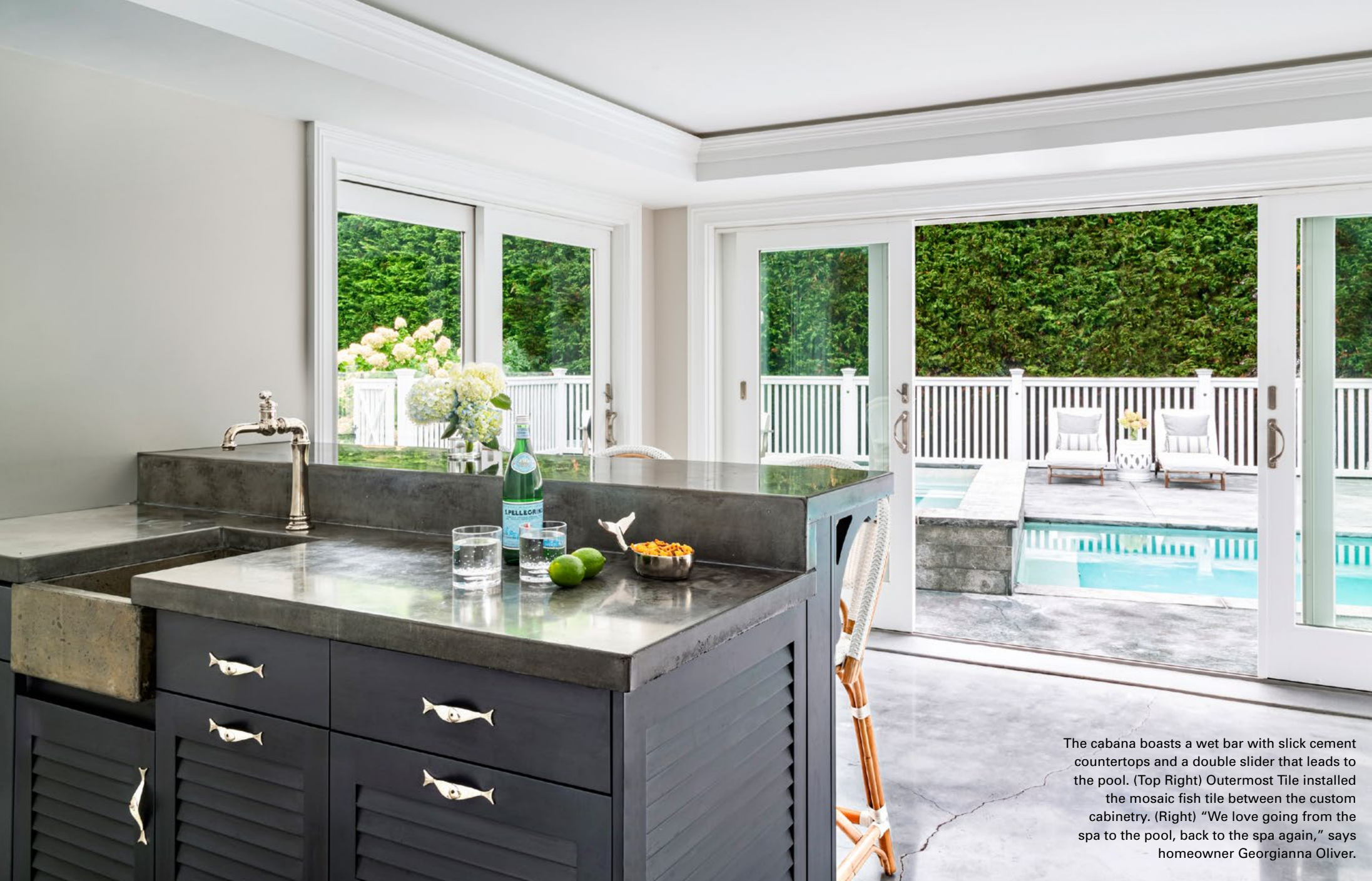
The cabana boasts a wet bar with slick cement countertops and a double slider that leads to the pool. (Top Right) Outermost Tile installed the mosaic fish tile between the custom cabinetry. (Right) “We love going from the spa to the pool, back to the spa again,” says homeowner Georgianna Oliver.