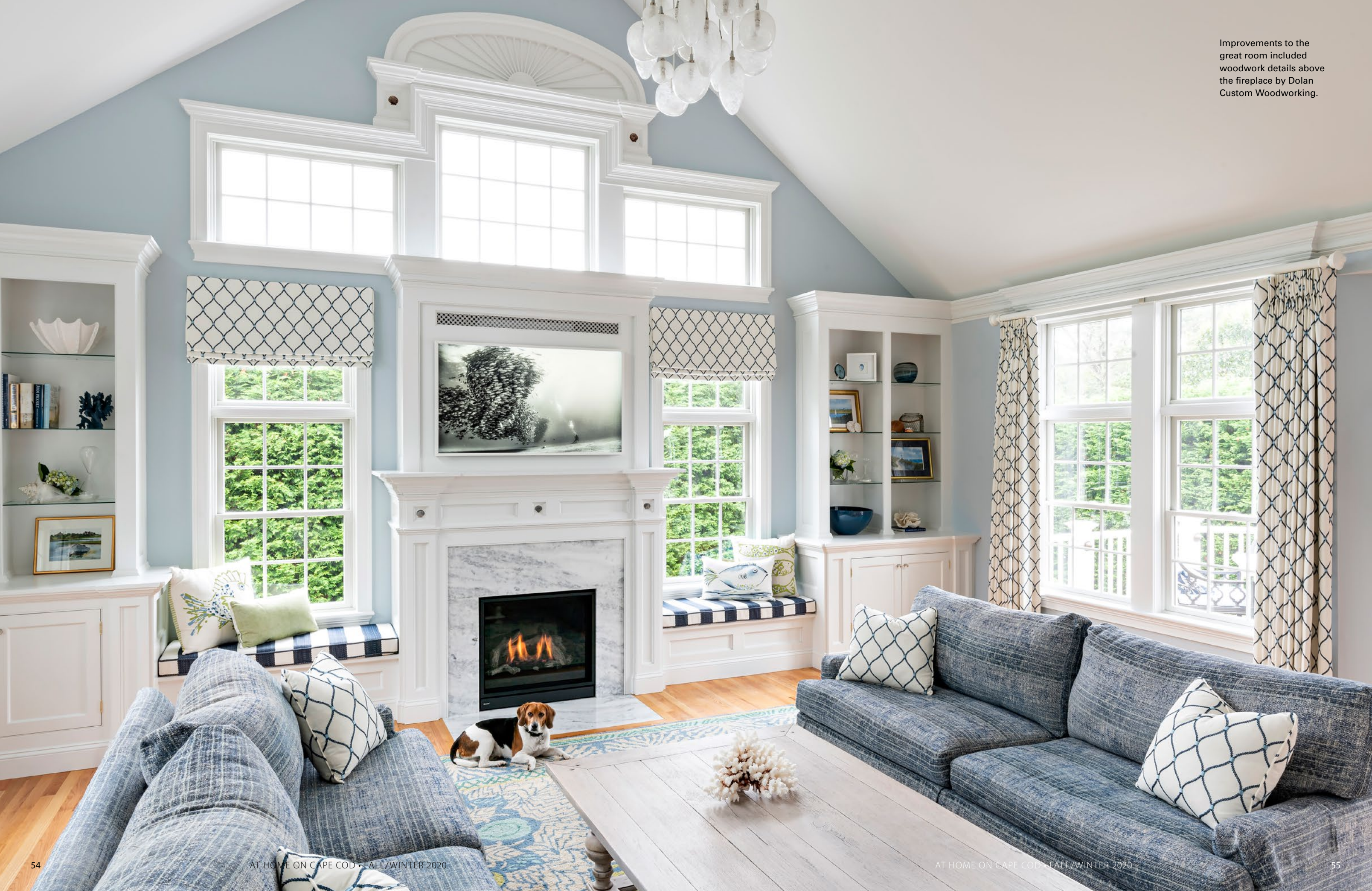
Improvements to the great room included woodwork details above the fireplace by Dolan Custom Woodworking.