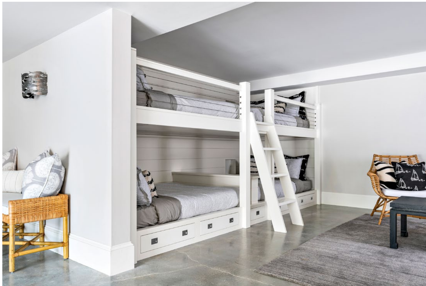
(Above) Bunk beds in the basement fit perfectly into the built space. (Right) A hanging bamboo chair, provided by Chatham Home, fits perfectly in a corner and reflects the whimsical design sense of the homeowner.

An earlier schematic design called for an extended deck off the dining room that would include a stone chimney for an outdoor fireplace. It would provide space for a dining table, couches and chairs by the fire, and some lounge chairs. But this was scrapped in favor of keeping guests situated around the pool deck.