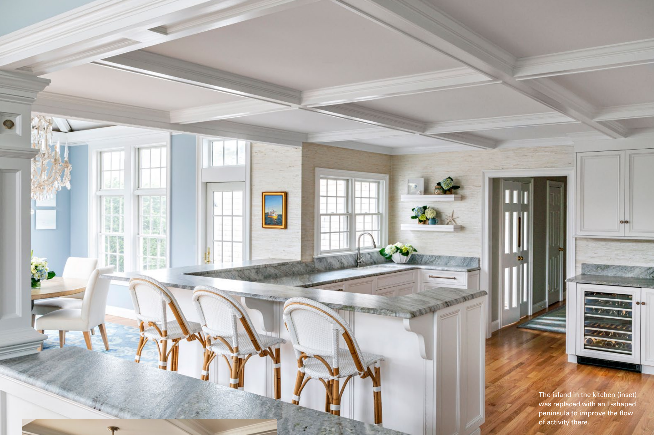
The island in the kitchen (inset) was replaced with an L-shaped peninsula to improve the flow of activity there.