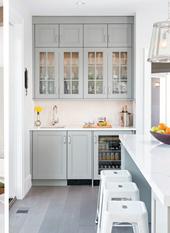
Stunning water views anchor the functional yet sleek kitchen.

Summer memories infused the graceful property situated on a saltwater pond in Chatham, MA. For more than a decade, a large and active family had relished their seasons in the sun on the elbow of Cape Cod in their beloved older home, but with everyone growing up, it appeared time to tear down. The couple and their five sons had the good fortune to choose SV Design to design their new, larger house.