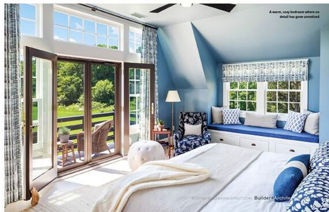
A warm, cozy bedroom where no detail has gone unnoticed