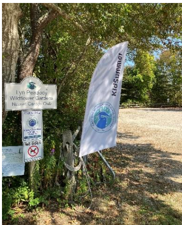
Figure 1: KidSummer Flag

Cape Cod Museum of Natural History 869 Main Street/Route 6A Brewster, MA 02631