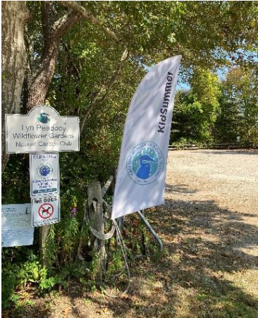
Figure 1: KidSummer Flag

Cape Cod Museum of Natural History 869 Main Street/Route 6A Brewster, MA 02631